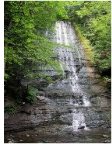
The big falls at Grimes Glen.

Sep. 5– Bare Hill Ring of Fire. Eleven hikers enjoyed a mild evening, with a full moon, on top of Bare Hill. The bonfire was spectacular as usual.