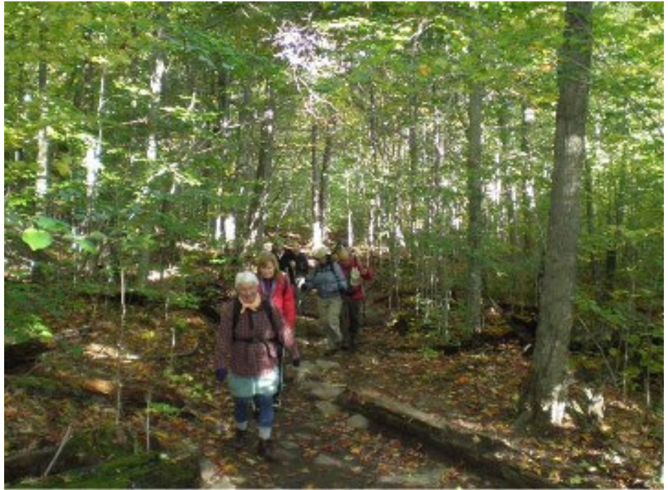
On the way to Marcy Dam.

So at about 7:45 AM we left Adirondack Loj and headed out on the Blue trail. We stopped at Marcy Dam for a few group pictures and rechecked our maps and GPS. Everything looked good and we were making decent