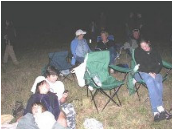
Enjoying the evening at the Ring of Fire.