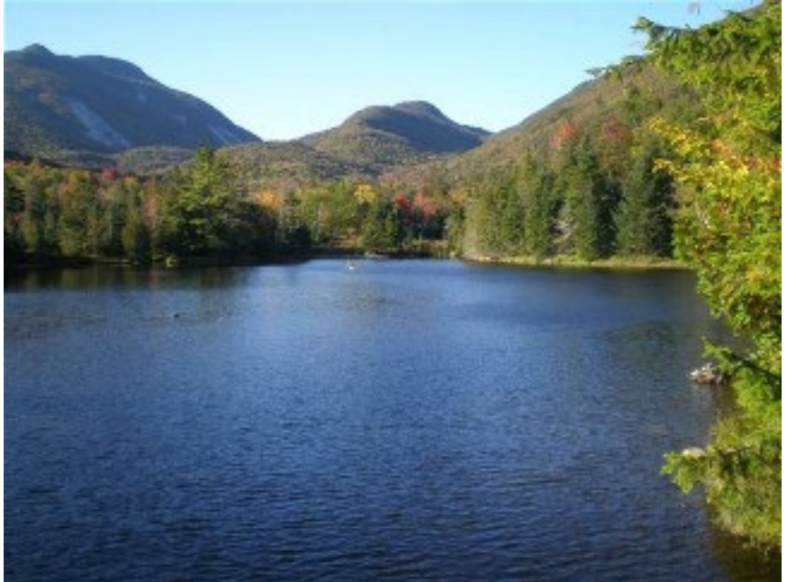
The view from Marcy Dam.

We headed back to Schroon Lake for a wonderful meal at Witherby's, followed by dessert at Marcia's. Have you every tasted Vanilla ice cream covered with raspberry dessert wine? It is delicious!