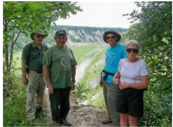
Overlooking the Genesee River Gorge at Letchworth State Park.