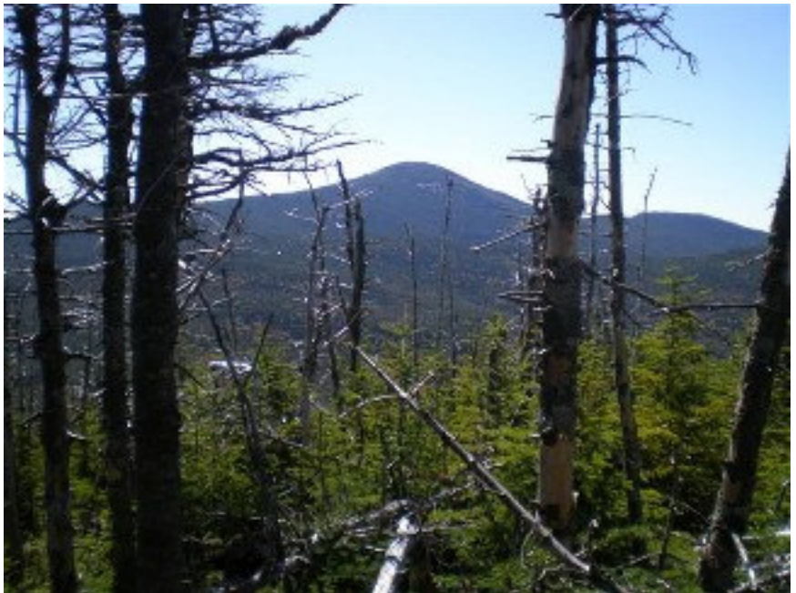
Looking at Mt. Marcy from Tabletop.

We awoke Sunday morning to a warm drizzle on our tents. Not a good day for hiking, so we went to breakfast, said our goodbyes to Marcia and headed back to Victor.