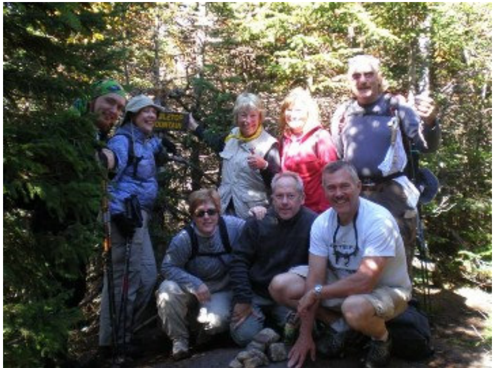
At the summit.